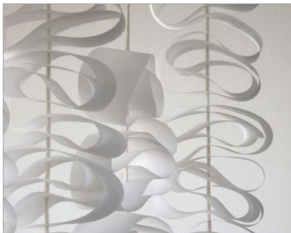
Move, a flexible hanging decoration in natural material.